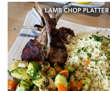
LAMB CHOP PLATTER