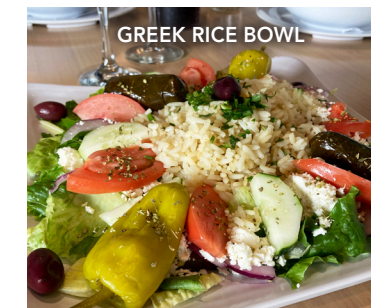
GREEK RICE BOWL