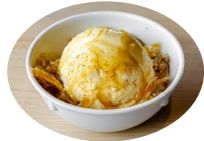
BAKLAVA ICE CREAM