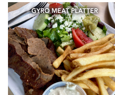
GYRO MEAT PLATTER

3025 E.MAIN ST. CORTLANDT MANOR, NY 10567