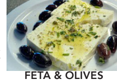
FETA & OLIVES