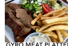
GYRO MEAT PLATTER