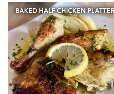
BAKED HALF CHICKEN PLATTER