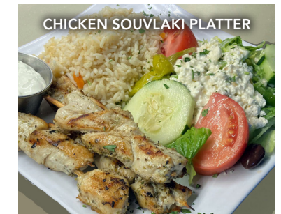
CHICKEN SOUVLAKI PLATTER