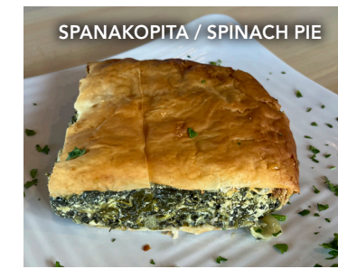
SPANAKOPITA / SPINACH PIE